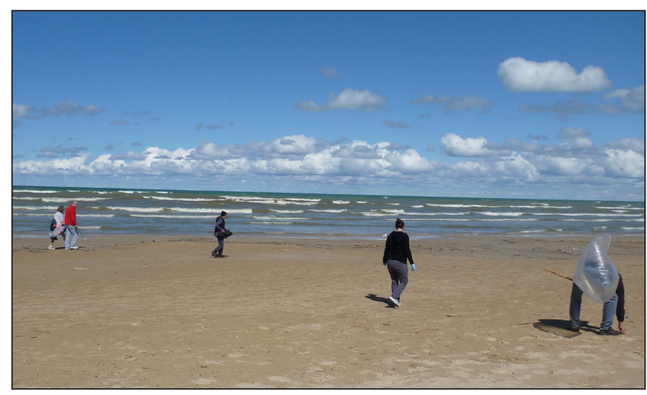
A group of local shoreline residents participated in a Great Canadian Shoreline Cleanup event at Centre Ipperwash Beach.