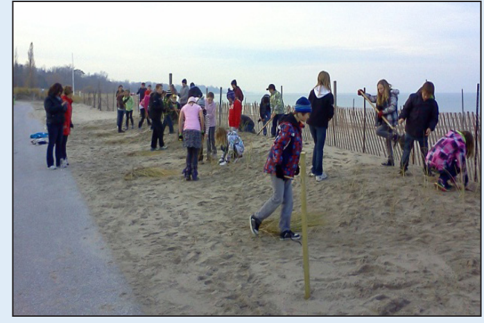
Grade 6, 7 students from Huron Heights Elementary plant locally harvested American Beachgrass at Station Beach.