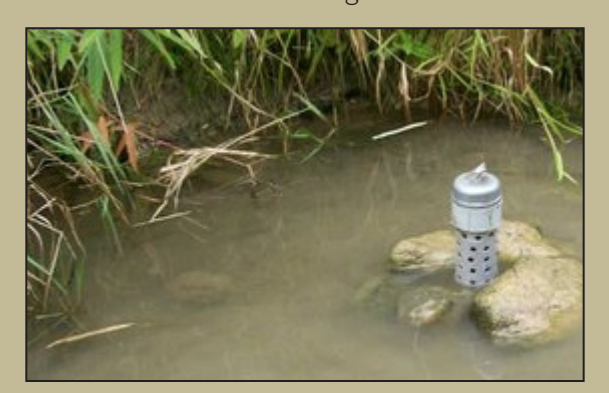
A temperature-level logger installed on the Pine River automatically records and stores water flow and temperature data.

On a broader scale, the results of monitoring on the Pine River will be a valuable component of the Healthy Lake Huron project and the development of a Rural Stormwater Management Model.