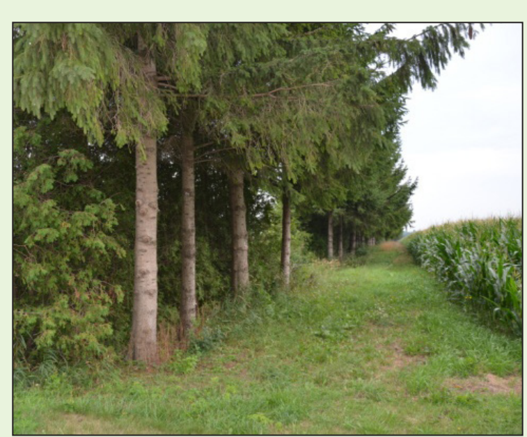
Eastern white cedar and Norway spruce planted as a windbreak on an Ontario farm.

To watch the videos, visit \underline{\text{ontario.ca/farmstewardship}} and click on windbreaks.