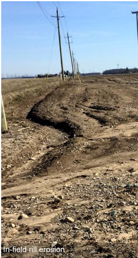
In-field rill erosion

Table adapted from Ministry of Agriculture , Food and Rural Affairs (2008)