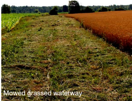
Mowed grassed waterway