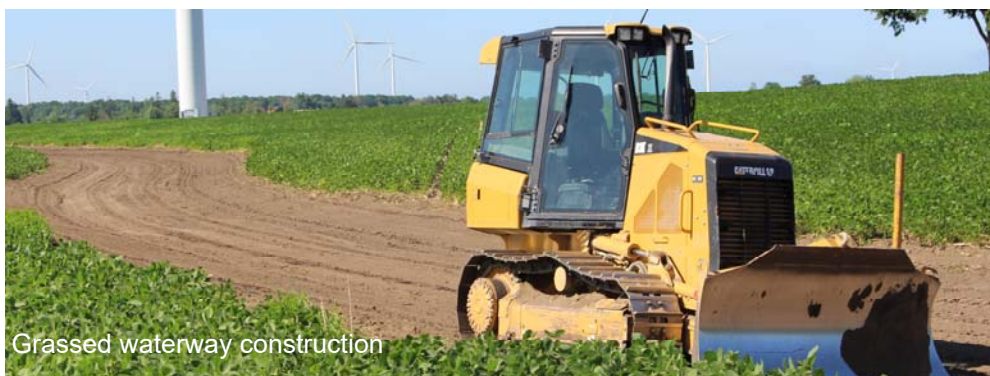
Grassed waterway construction