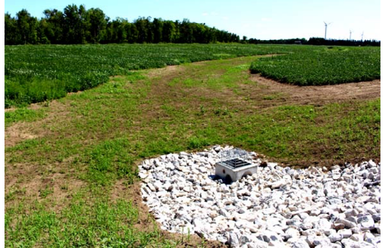
The saucer shape of the grassed waterway guides water to where you want it to go